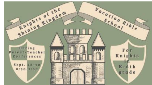
La Vista CON White Rock, NM