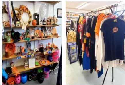
Yesterday and Today Thrift Shop Aztec CON