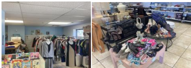
Mission ABQ: Grace Thrift Store

Welcomes Aztec Church of the Nazarene and 26:16 Church of the Nazarene. Thanks for coming down today and helping get the first load of firewood out to the elders on the Prewitt Reservation