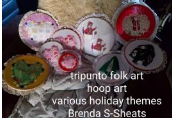
tripunto folk art hoop art various holiday themes Brenda S-Sheats

SATURDAY, OCTOBER 15, 2022 AT 9 AM – 2 PM